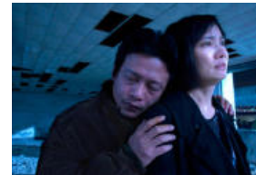
The First Poster for Venice Film Festival Jury Prize Winner 'Stray Dogs' is Mesmerizing