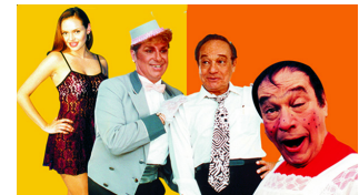
Lo Mejor de Teto