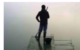
5 Must-See Latin American Films From This Year's