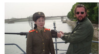
Vice Guide to North Korea - Trailer